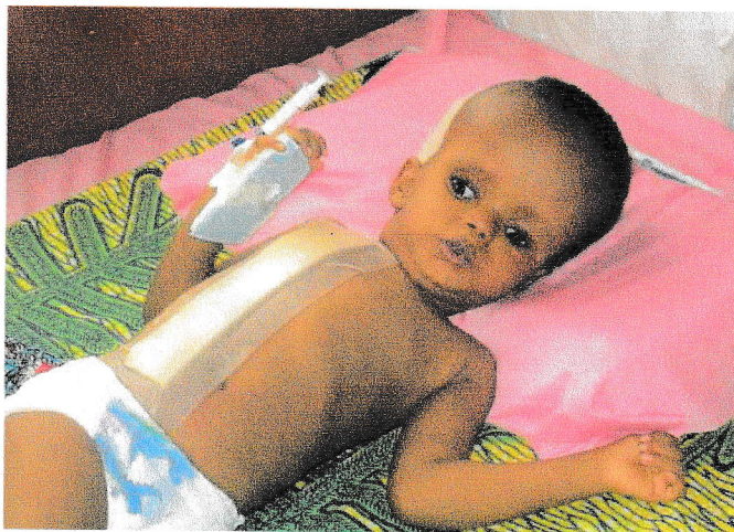
Child with hydrocephalus after shunt implanatation