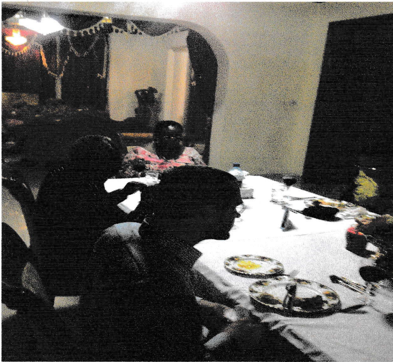
Dinner with the First Lady, Mrs Sia Koroma