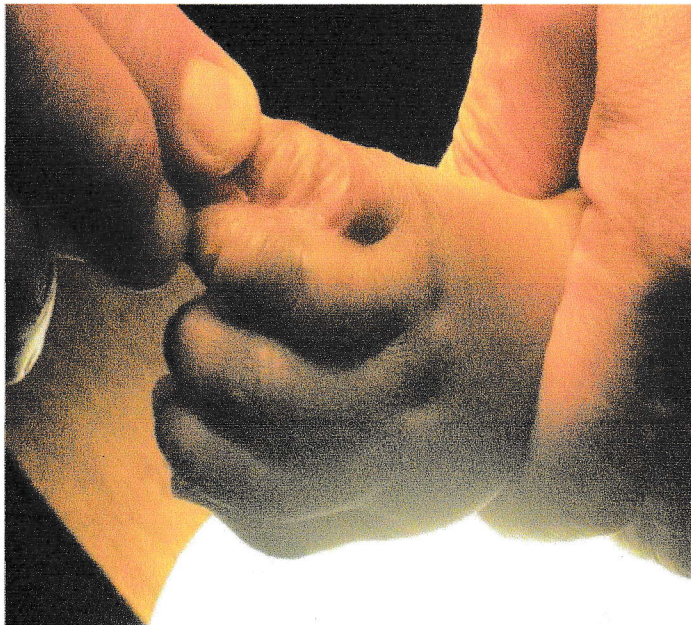
Child with syndactyly