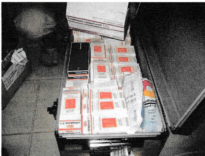
Some of the drugs provided