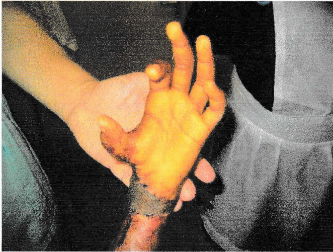
Child after plastic surgery

Am Sandberg 20 34253 Lohfelden Tel. privat 0561/516608 E-Mail m.wright@gmx.net